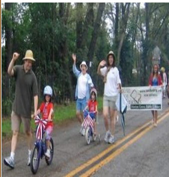
Friends members and families walked the 4th of July parade in a drizzle but spirits were bright.

We marched with kids on bikes whose faces had been painted in the library's "Go Wild" theme. Our teenage participants carried our banners. Friends board members handed out candy and "goodies" promoting the upcoming LabFest event that the Library helped sponsor later in July.