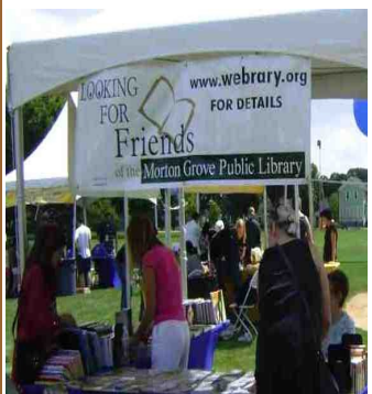
FMGPL offered used books for sale at the Lab Fest.

In addition to the books on sale every day near the circulation desk, volunteers also sell books at special events such as the Spring Blast and the Lab Fest. All paper back books are $.50 and all hard cover books are $1.00.